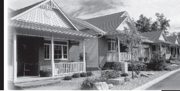
Billings Promenade Adult Lifestyle Community in Ottawa South.