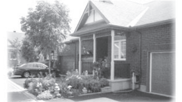
Meadow Glen Adult Lifestyle Community in Nepean.