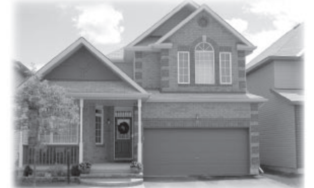
Highbury Park Single Family Homes in Barrhaven.