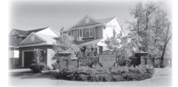
Noblewood Ridge Single Family Homes in a Ravine Setting.