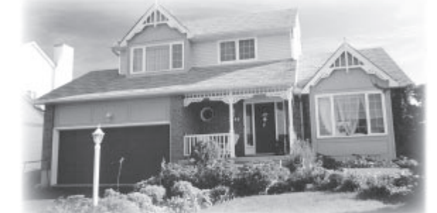
Valmont-on-the-Green Golfside Community of Single Family Homes.